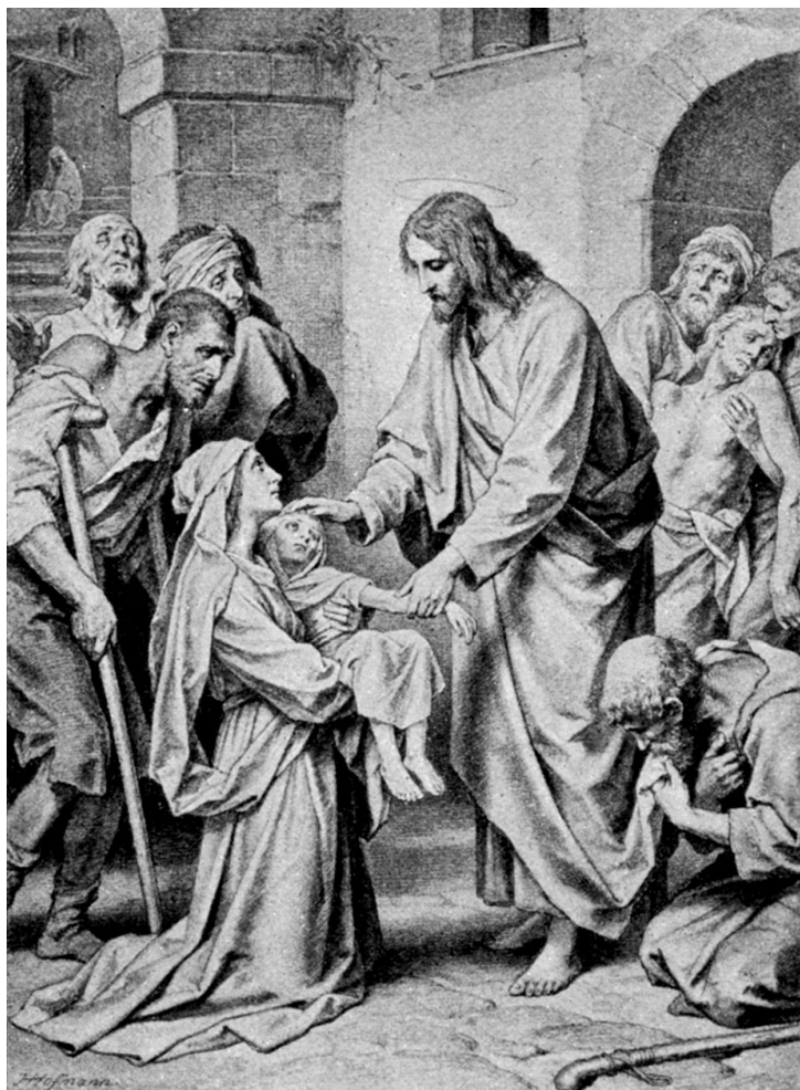
The Healing Christ