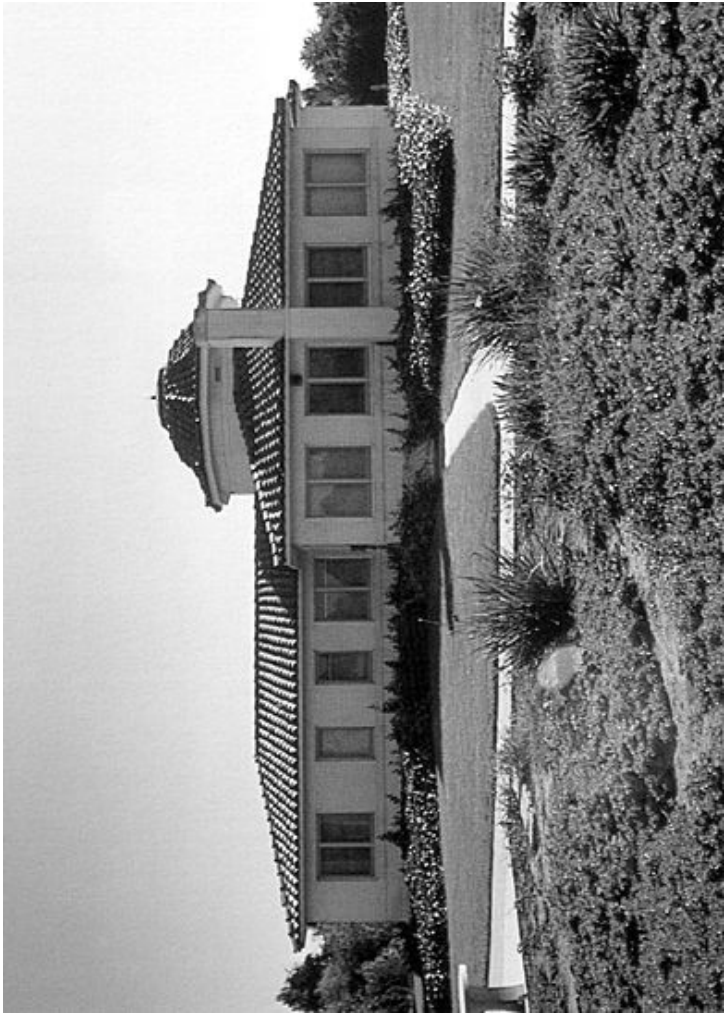
Healing Department, Rosicrucian Fellowship, Oceanside, CA